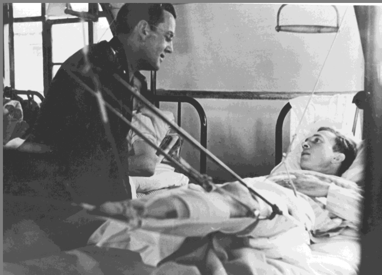
Cirencester Hosp. 7 Aug 1944.

The Band kept up a hectic schedule in between broadcasts, with little time off. They travelled all over England performing live concerts at airbases, hospitals, and concert halls, many times playing two or three venues in one day.