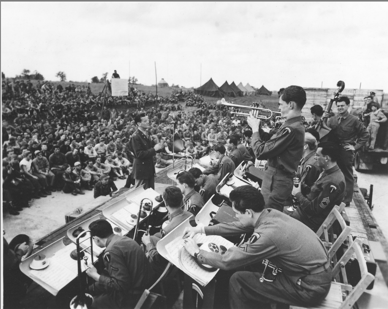
Playing for troops at a B17 base in England on 23 August 1944. Glenn hoped to do the same for the troops on the Continent.

Glenn wanted to bring the music of the AAF Band to the frontline troops, and pushed to take the band to Paris for a series of concerts. However, the BBC was reluctant to let them go because they wouldn't be able to complete their AEFP broadcast schedule. A compromise was finally reached that allowed Major Miller (promoted in August 1944) to take the Band to Paris on the condition that six-weeks-worth of AEFP broadcasts were pre-recorded before they departed. The highlight of the six week trip was to be a Christmas Day concert for the troops, broadcast live to England and America.