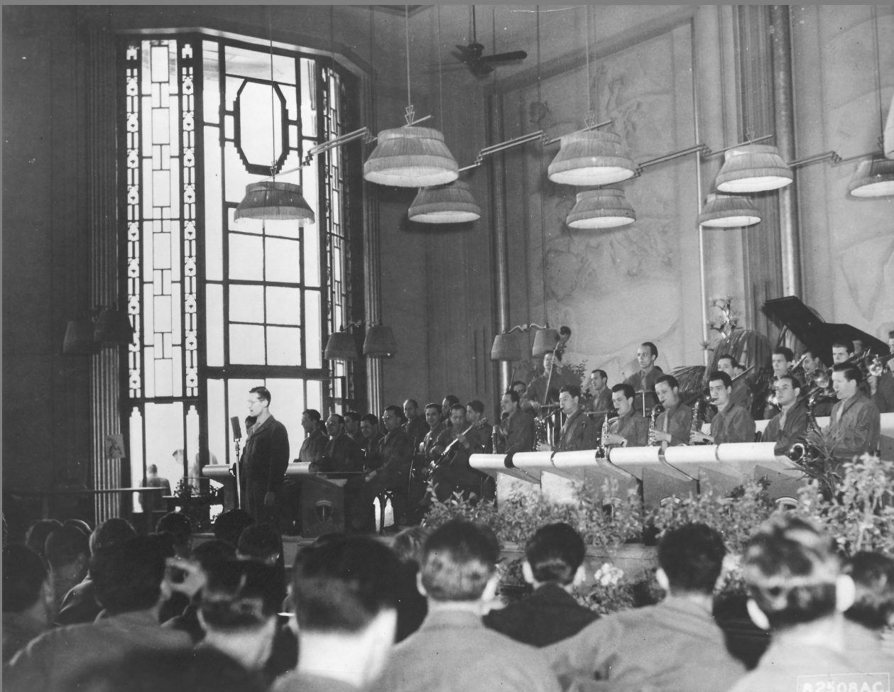
Playing a concert for troops on rest leave at the ARC Club in Nice, France. On 3 May 1945.