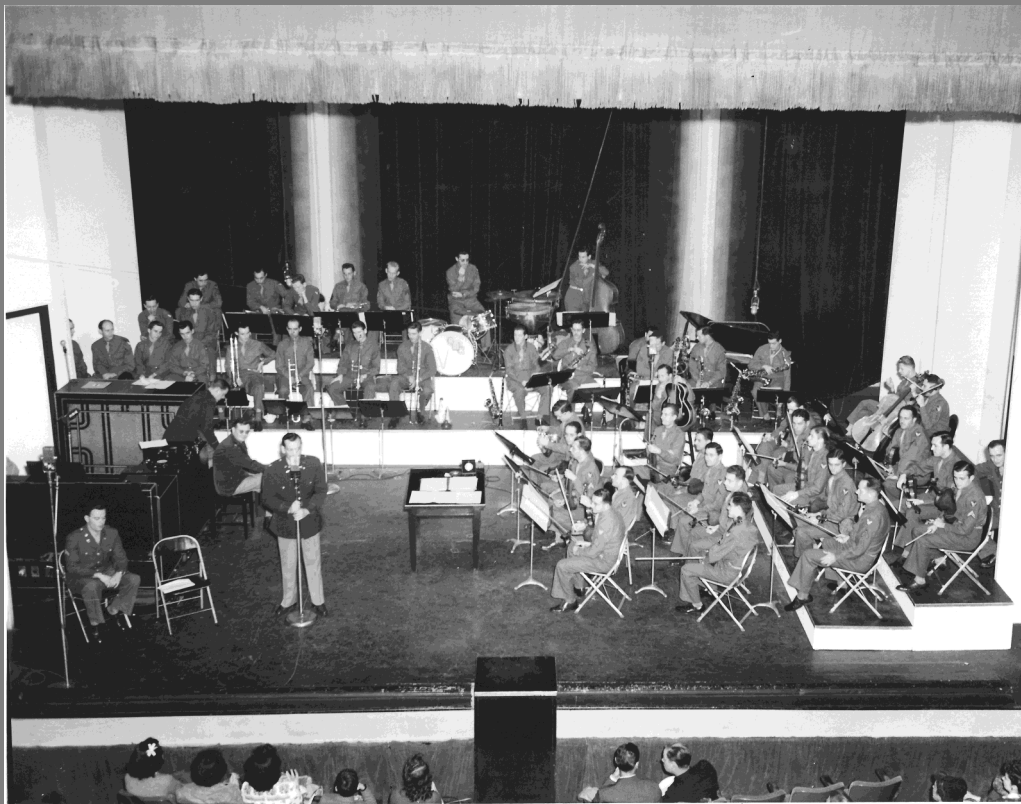
The “super band” included a full section of strings, seen here playing an “I Sustain the Wings” broadcast.