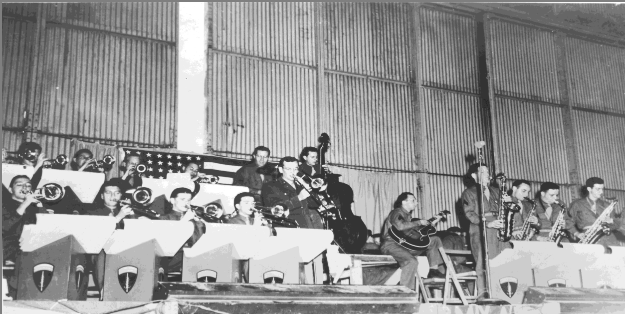
Playing a concert for the 56th Fighter Group on 6 Aug 1944 in Baxted, England. One of the hundreds of concerts played for the troops while stationed in the ETO.

Major Miller assembled what many consider to be one of the greatest big bands ever, featuring the top musicians available. The band set a new musical standard by successfully combining classical music and jazz. The full orchestra arrangements combining “swing” music and strings to create an enjoyable jazz sound, set it apart from all others.