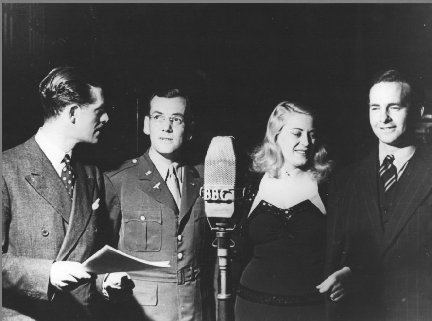
Glenn Miller at a recording with Irene Manning in London, 1944.