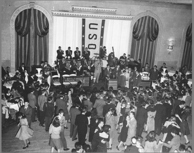
"Sunset Serenade" from the Café Rouge at the Hotel Pennsylvania in New York City. Admission was donated to the USO.

Each base submitted their favorite Miller tune which was played during the broadcast. The listening public voted for which tune they thought should win. The winning base received a new RCA radio-phonograph player and 50 popular music records.