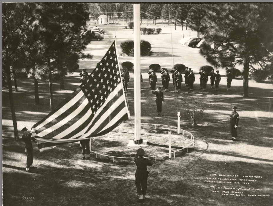
Playing “Retreat” at Knollwood Farm, North Carolina in 1943.

Glenn was determined to modernize military music. He wanted to take music beyond the antiquated Sousa marches of WWI and update them with swinging march arrangements of jazz tunes such as the St. Louis Blues March and marching versions of Blues in the Night and Jersey Bounce. In addition, the bands would play modern big band tunes to give the soldiers “a hunk of home.”