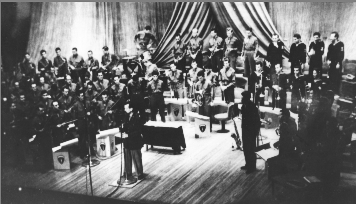
Playing a broadcast with the U.S. Navy Dance Band at the Queensbury Club in London on 21 September 1944.

General Dwight Eisenhower, Supreme Commander of the AEF (Allied Expeditionary Force), wanted a special radio service for the allied forces under his command. The new radio service would be a vital way of maintaining troop morale and a sense of unity among the force's various nationalities. Broadcasts would provide troops with news, information, and entertainment. The broadcast proportions were split based upon the proportions of the three main armies in the AEF, 50% US, 35% British, 15% Canadian. Captain Miller's band was selected to represent the U.S. portion of programming. The band's primary duty was to perform regular broadcasts on the AEFP. The band was assigned a heavy schedule of broadcasting, originally performing ten programs (or 3 hours, 15 minutes) a week. By the time the band left for France, they were playing seventeen radio shows a week.