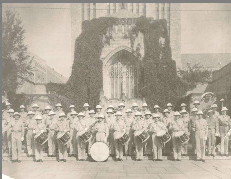
The Band while stationed at New Haven, Connecticut.