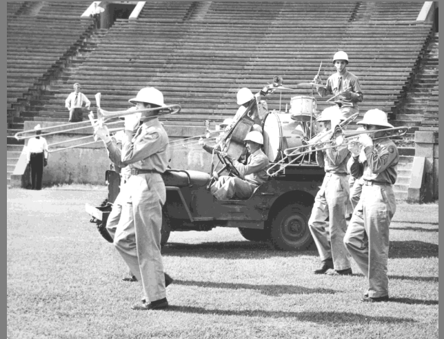
A Jeep-mounted rhythm section in action.

Not all officers agreed with the new approach to modern military music. Captain Miller received negative feedback from older career officers who wanted to stick with the Sousa march tradition. One officer reportedly said, "Look Captain Miller. We played those Sousa marches straight in the last war and we did all right, didn't we?"